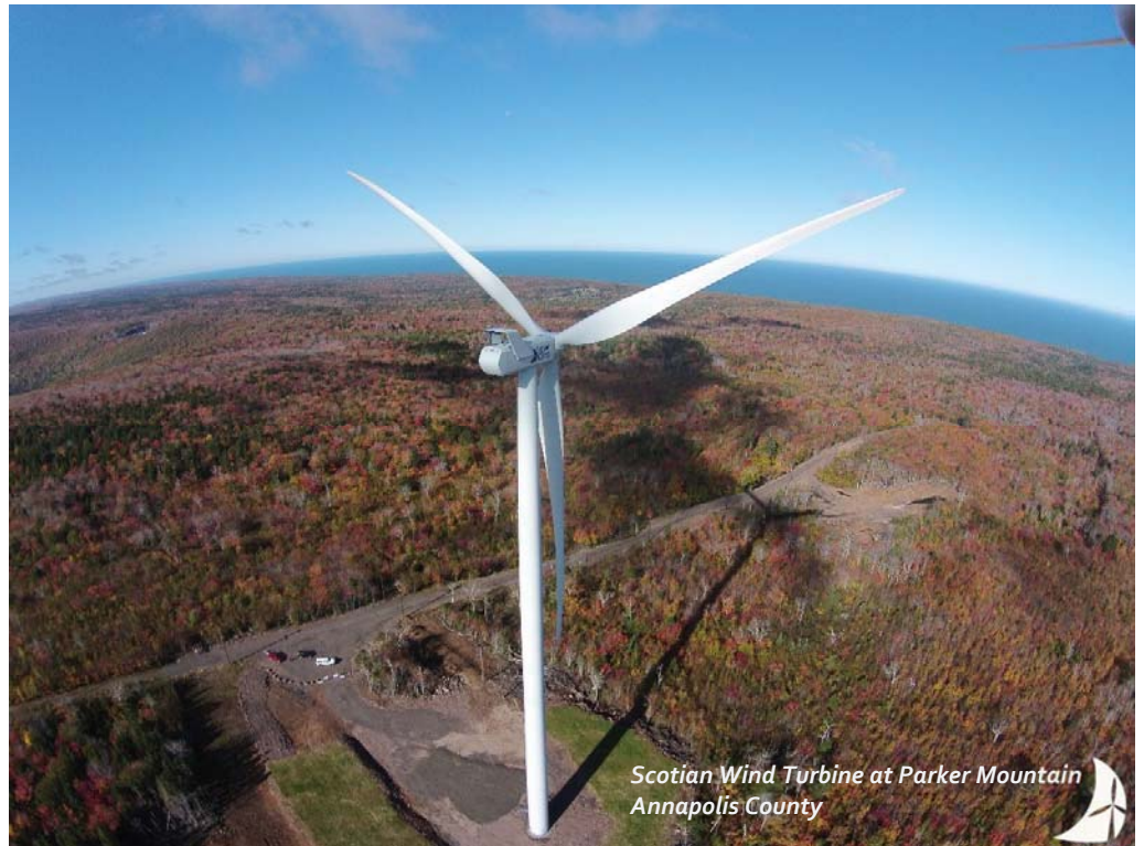
Scotian Wind Turbine at Parker Mountain Annapolis County

The administration of these funds will be handled locally by local community groups and residents. The community will decide how to distribute the funds through a committee drawn from local stakeholders and organizations. The kinds of projects that could receive funds include: